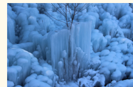
One of the three major icicles in Chichibu. Ashigakubo icicles

Chef's table&Cafe HIMIDORI with Chichibu alcohol Pairing Dinner