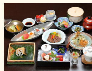
Image of Choseikan Kaiseki cuisine

Choseikan Lunch is a traditional meal at historical Ryokan .